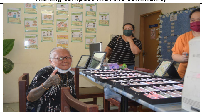
Eye checking for the community