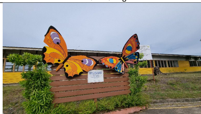
SK Long Bedian

It was a successful event, made possible with the amazing coordination and hard work of the teachers in SK Long Bedian. IKM and partners sincerely thanked the teachers for giving us an unforgettable experience in Long Bedian and assurance that, the move of K 2 M to inspire rural students shall continue. The World Bank documented that Sarawak has the largest proportion of the nation's rural population. In the district of Baram alone, there are a total of 73 rural schools covering an area of some 20,000 km 2 . Some of these schools are very far and are only accessible through logging roads and rivers. Our rural community needs us. It is indeed challenging to reach out to our rural community but with the partnerships between agencies/institutions/private/NGOs, no one is left behind. Mother Teresa said, "Not all of us can do great things, but we can do small things with great love".