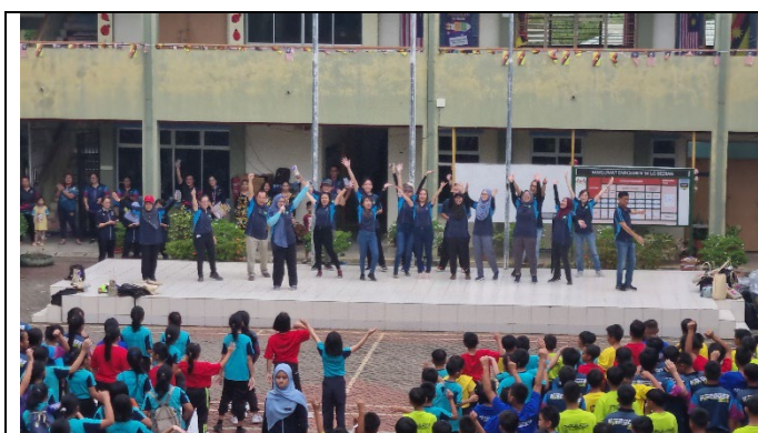
Students and K 2 M Team singing "Keluarga Malaysia"

It was a successful event, made possible with the amazing coordination and hard work of the teachers in SK Long Bedian. IKM and partners sincerely thanked the teachers for giving us an unforgettable experience in Long Bedian and assurance that, the move of K 2 M to inspire rural students shall continue. The World Bank documented that Sarawak has the largest proportion of the nation's rural population. In the district of Baram alone, there are a total of 73 rural schools covering an area of some 20,000 km 2 . Some of these schools are very far and are only accessible through logging roads and rivers. Our rural community needs us. It is indeed challenging to reach out to our rural community but with the partnerships between agencies/institutions/private/NGOs, no one is left behind. Mother Teresa said, "Not all of us can do great things, but we can do small things with great love".