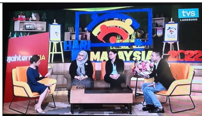
K 2 M in TVS

https://ukas.sarawak.gov.my/2022/09/24/k2m-usaha-tarik-minat-pelajar-luar-bandar/