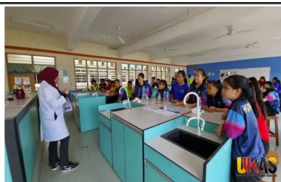
K2M Usaha Tarik Minat Pelajar Luar Bandar