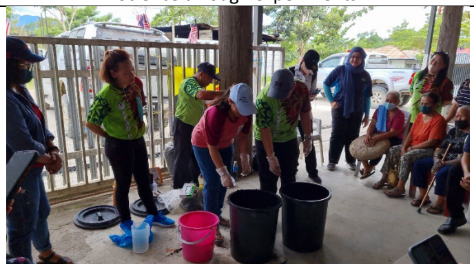
Making compost with the community