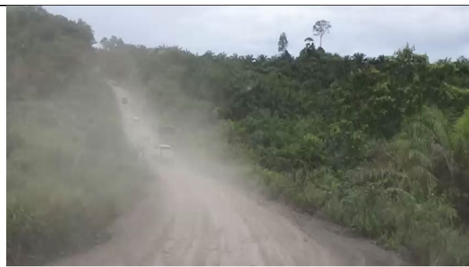
Logging roads to Long Bedian

Long Bedian is a lovely little settlement, hidden away from the busy town, lived by mainly Kayan community. On K 2 M 2022 (22 September 2022), IKM (Sarawak Branch) spent a day with the students and the community to inspire, to learn together and to care. This is some memorable experience to share.