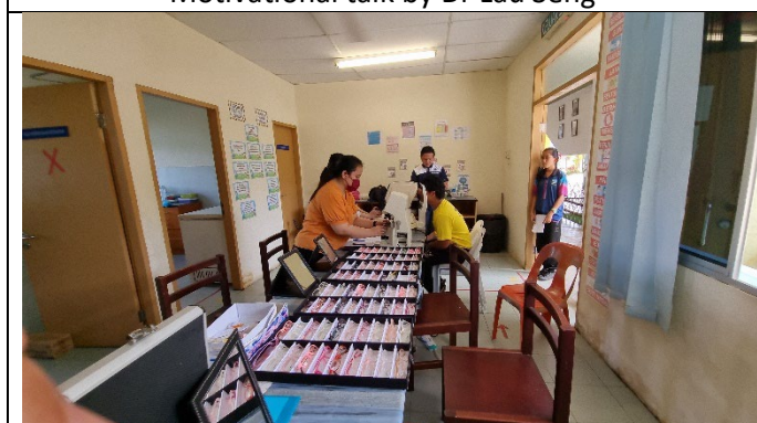
Eye checking for students