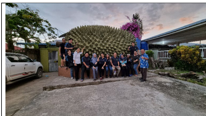
Giant "Durian" in Long Bedian