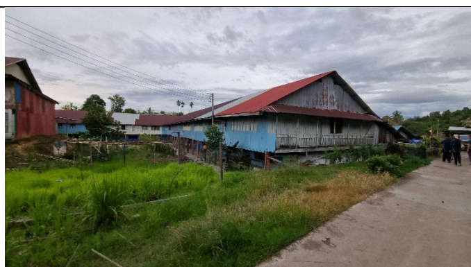
The long house in Long Bedian