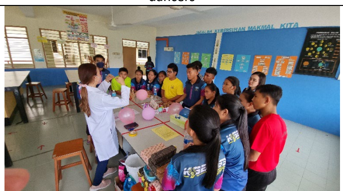
Science through experiments