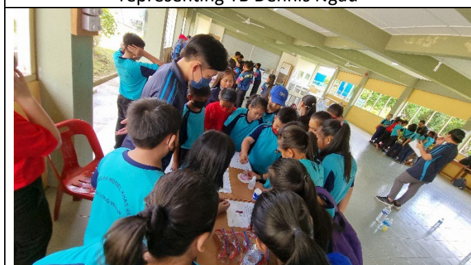
Science through games