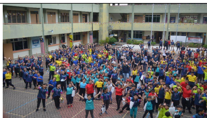
Amazing students of SK Long Bedian