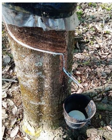
Figure 1. Tapped rubber tree.